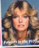
Fawcett in the 1970s.