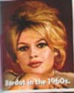
Bardot in the 1960s.