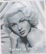
Turner in 1935.