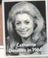
Catherine Deneuve in 1968.