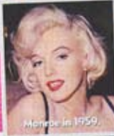
Monroe in 1959.